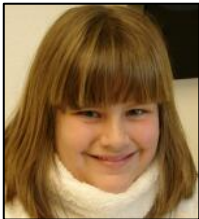
by Lauren, fifth grade writer

So much depends upon Wondrous underwater adventures, fish, Naturally beautiful water, oceans, Sand, floating fish. Life.